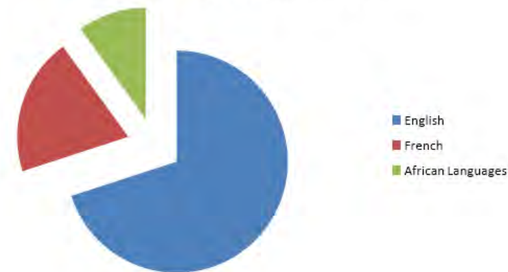
AMET TV Languages Make Up

Enjoy programming produced and developed by AMET TV's in house production team, exclusively created for our audience.